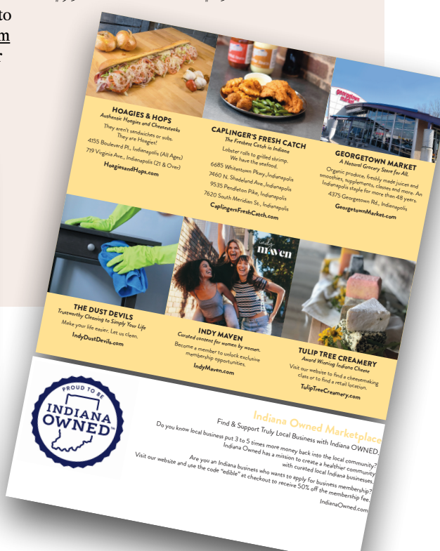
Edible Indy P.O. Box 155 Zionsville, Indiana 46077 EdibleIndy.com